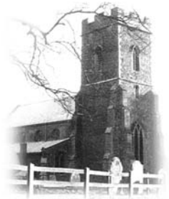
St Peter's, Little Thurlow