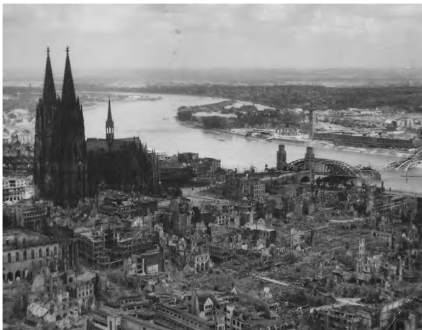
Above – Cologne in 1944 after the bombing raids and below, as it is today.