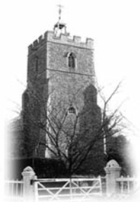
All Saints, Great Thurlow