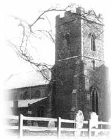
St Peter's, Little Thurlow